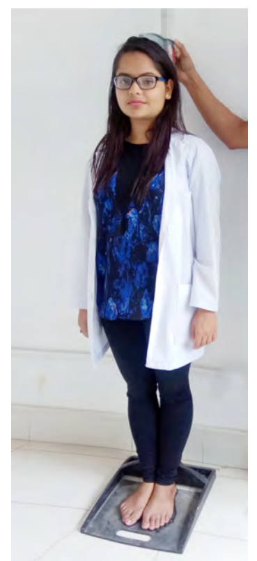
Fig 1. Measurement of stature with a stadiometer

A straight distance between the most prominent part of the heel backwards (pterion) and