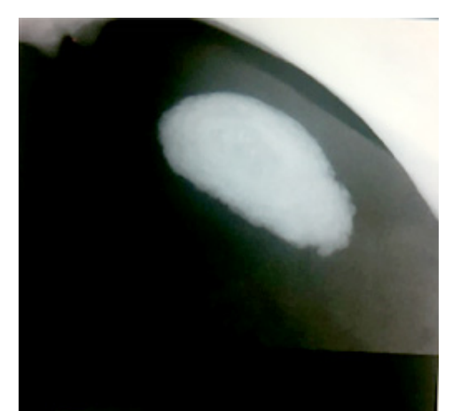
Fig 2: Occlusal X-ray showing radio-opacity in left floor of mouth

Ultrasonography revealed a solid mass with distal acoustic shadow measuring 16 mm along its greatest length located near the orifice of Wharton duct.