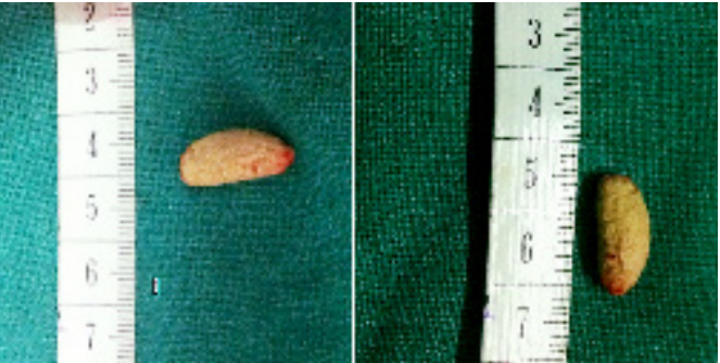
Fig 3: Picture showing size of the calculus removed from left submandibular duct.

Patient was reviewed at one month. She was asymptomatic and had no complains. The submandibular gland was no longer palpable and