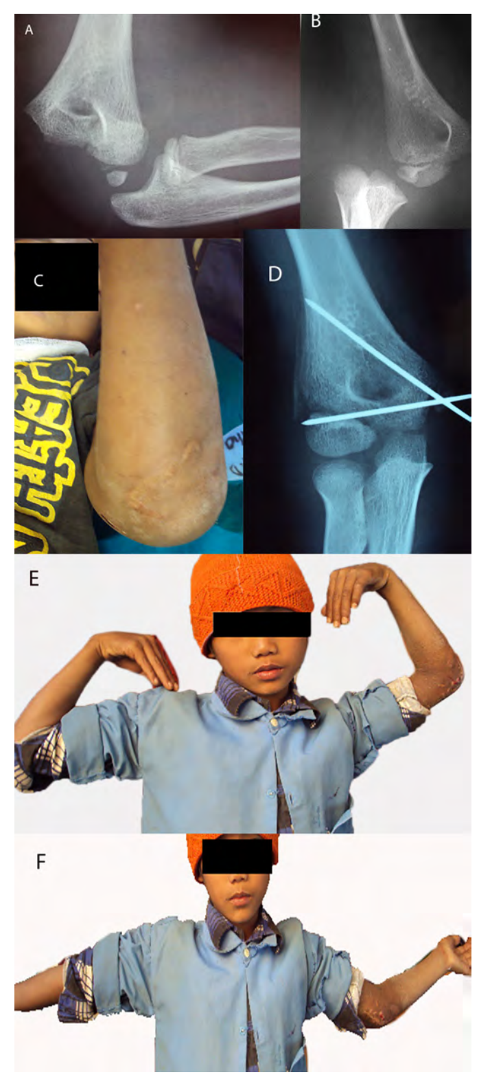
Fig 1: A,B . Representative pre-reduction radiographs (patient 1) showing a displaced medial epicondyle fracture in association with a posterolateral elbow dislocation; C . Injured elbow; D . 2 months postoperative radiographs showing fracture by 2 k wires. Note mild lateral heterotrophic ossification; Clinical picture showing 95° flexion and extension lag of 40°.

and remaining 15 elbows were reduced either in Emergency Department or in operating room. The dominant elbow was injured in 14(70%) patients. The injuries were categorized in: six type II, nine type III, two type IV and three type V.