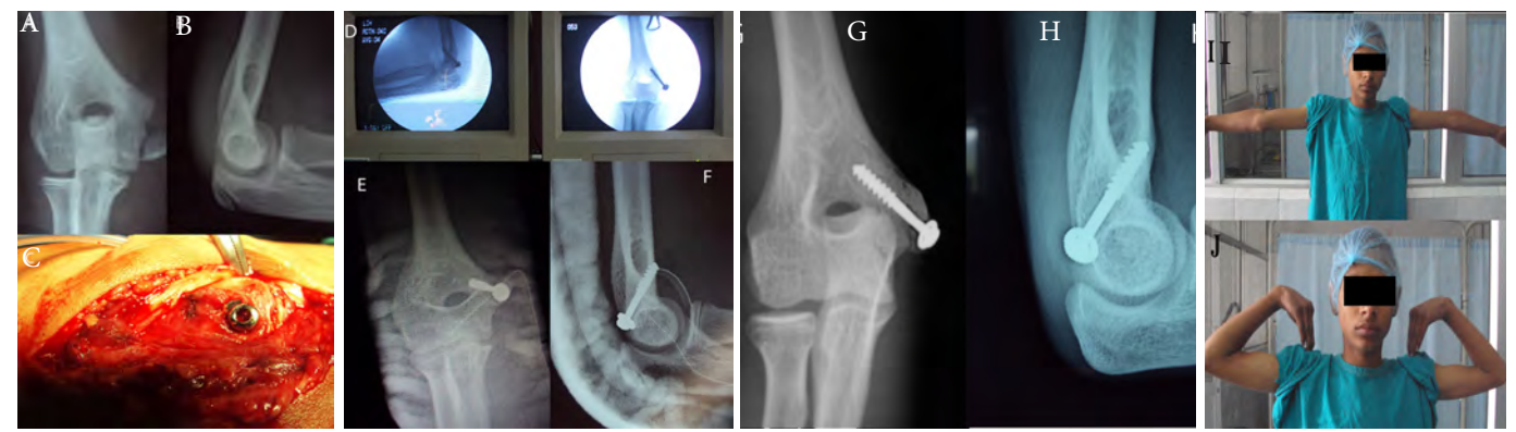
Fig 2: A,B . Antero-posterior and lateral X ray showing (patient 3) medial epicondylar fracture; C . Intraoperative picture showing a screw fixation following valgus stress test uncovering a postero-lateral dislocation of the elbow; D . Peroperative fluoroscopic images with anatomic reduction and fixation with screw. E,F . Immediate postopreative X-rays. G,H . 9 months follow up radiographs showing bony healing of avulsed medial epicondylar fragment; I,J . No deformity appeared in the elbow region at the final follow up, while full movement of the elbow was restored completely.