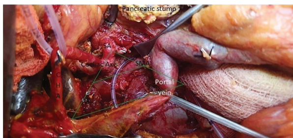
Figure 3: After clearance of apical tissue around Superior Mesenteric artery (SMA) and Coeliac axis(CA). CHA: Common hepatic artery; SA: Splenic artery; SMA: Superior mesenteric artery.