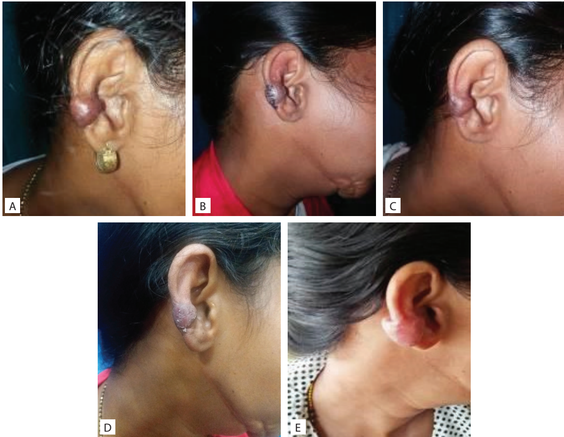
Figure 3: 38years female with right helical ear keloid (A: Pre-operative, B: post operative 2 weeks at the time of suture removal, she developed hypersensitivity to injection triamcinolone: C: Follow up after 3 weeks post-operative, D: follow-up after 6 weeks, E: 6 months follow-up.