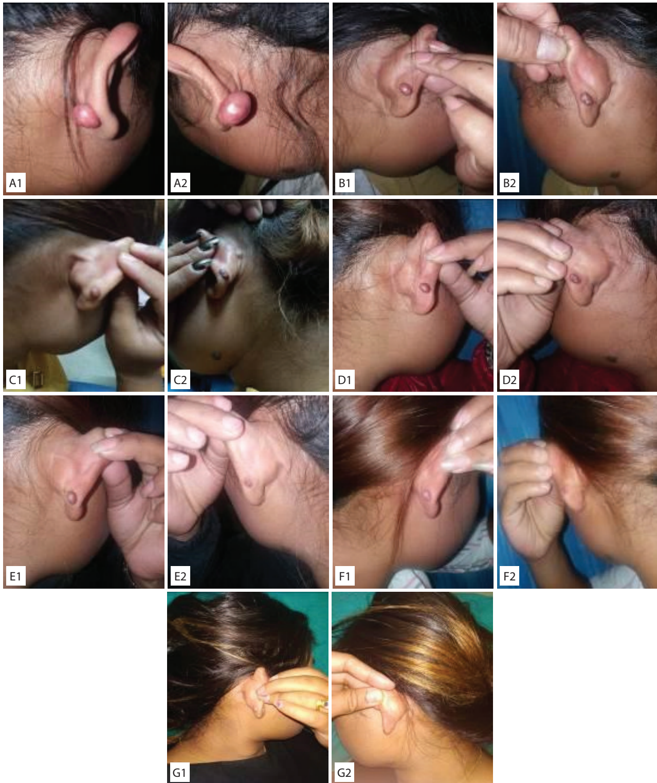
Figure 2: 30years female with bilateral posterior ear lobule ear keloid (A1&A2: Right and left Pre-operative, B1 &B2: Right and left post operative after 1st dose of injection triamcinolone, C1 &C2: Right and left after second dose, D1 &D2: Right and Left after third dose, E1&E2: Right and left after fourth dose, F1 & F2: Right and left after fifth dose, G1&G2: Right and left follow up after six months)