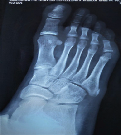
Figure 5: Post-operative radiograph (oblique view)