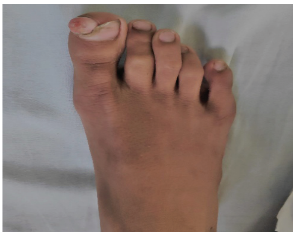
Figure 1: Subungual exostosis of right great toe

On histopathological examination of the lesion, a characteristic trabecular pattern of mature bone covered with hyaline and fibrocartilaginous cap was seen. There was lack of true anaplasia, thereby confirming the diagnosis of subungual exostosis (Figure 4). Post-operative radiograph was taken which confirmed complete excision of the lesion (Figure 5).