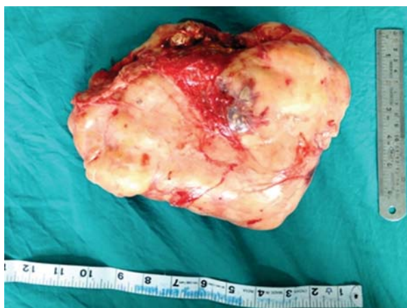
Figure 1: Gross appearance of the tumor