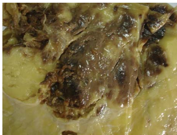
Figure 2: Cut surface showing haemorrhagic foci within tumor