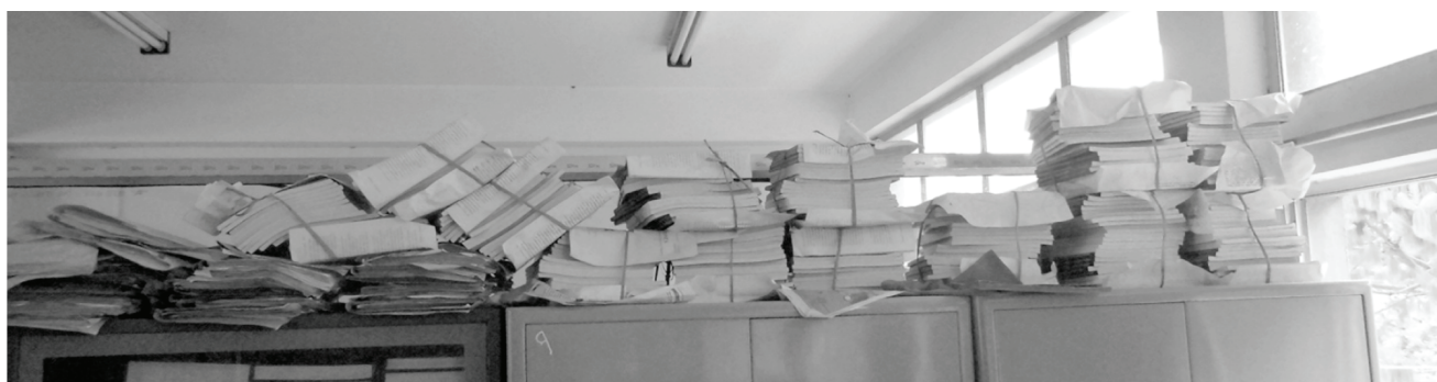
Fig. 4. Recent issues of JIST deposited at Dean's Office, TU

The poor distribution of the journal is the main reason of the low citation rate of the published papers. The citation of the JIST papers by JIST contributors is also very low which is represented by 2 in vol. 2, 5 in vol. 3, 3 in vol. 4, 1 in vol. 5, 3 in vol. 18, no. 2 and 5 in vol. 19, no. 1. Unless we disseminate research findings by distributing publication either online or the printed