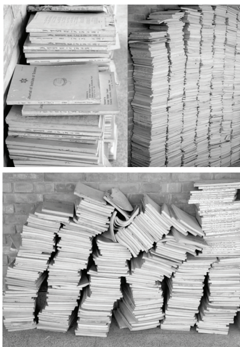
Fig. 3. Thousands of Copies of JIST, dumped in gallery of the Central Department of Physics, Kirtipur

one and half month to locate misplaced old issues of the journal in the Central Library, TU, Kirtipur. During the course of writing review of JIST, author found thousands of copies of all old issues (vol. 1 to 6) of JIST have been dumped in an open gallery of the Central Department of Physics, TU, Kirtipur (Fig. 3) as soon as the retirement of the then Chief editor. This evidence clearly indicates the condition of the distribution system of the journal which has to be seriously improved in future.