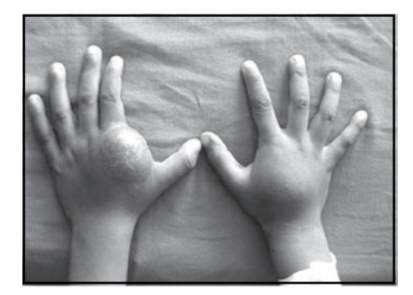
Fig 1 : Photographs of bilateral hands showing swelling over 1st web space, and excoriation of skin on left hand.

On examination of his hands, left hand had 3 x 3.5 cm oval shaped swelling over the second metacarpal extending to the first web space with excoriated skin. On palpation local temperature was mildly raised with minimal tenderness. Consistency of the swelling was soft to firm. Right hand swelling was almost similar but less prominent with diffuse margins and more healthy skin over it (Figure 1).