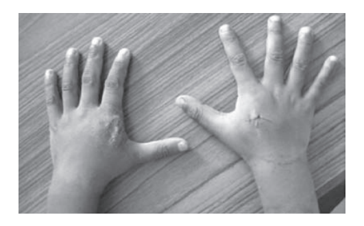
Fig. 6: Follow up visit on 10th post op day. Wound is healing well and size of the swellings regressing.

He was referred to local Directly Observed Therapy Short Course (DOTS) clinic for supply of the anti-tubercular drugs. According to the record of the DOTS clinic he completed the ATT course and had complete recovery from disease. However, he did not come for follow-up to our hospital.