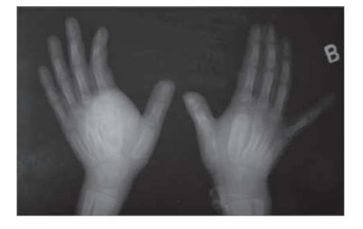
Fig. 3: X- Ray of bilateral hands AP view showing "spina ventosa" changes in second meta-carpals of both hands.

In the left hand the lesion was at stage 3 (expansion of the second metacarpals with periosteal thickening, destruction of the bone with sequestrum) and in the right hand the lesion was at stage 2 (the metacarpal bone was swollen) 15 (Figure 3).