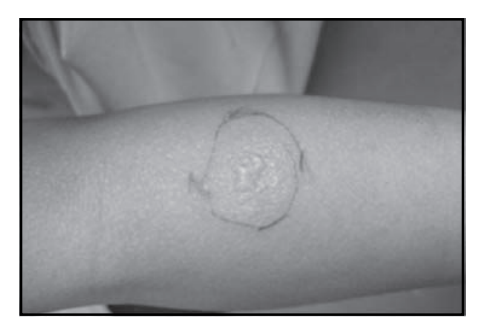
Fig. 2: Result of Montoux test, inducation area after 72 hours.

In the left hand the lesion was at stage 3 (expansion of the second metacarpals with periosteal thickening, destruction of the bone with sequestrum) and in the right hand the lesion was at stage 2 (the metacarpal bone was swollen) 15 (Figure 3).