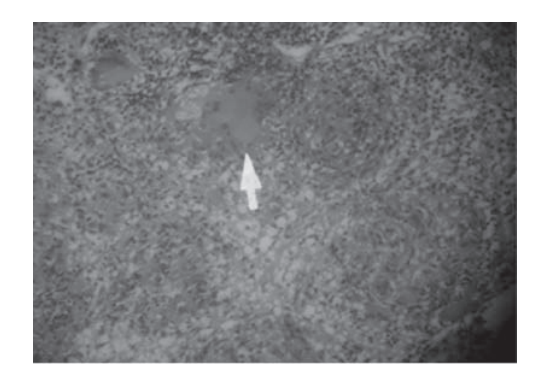
Fig. 5: Histopathological findings showing tubercular granuloma. Arrow shows area of area of casseation.

During operation thick pus mixed with unhealthy granulation tissues and pieces of sequestra was removed without much disturbing the affected bones. His histopathological report showed typical features of tubercular granuloma (Figure 5).