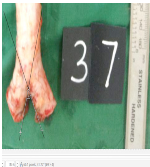
Figure 1. Part of the GIMP window showing photograph of a specimen with measurement of subcarinal angle (number at bottom of window). The reading of 41.77^\circ was rounded off to 42^\circ during entry