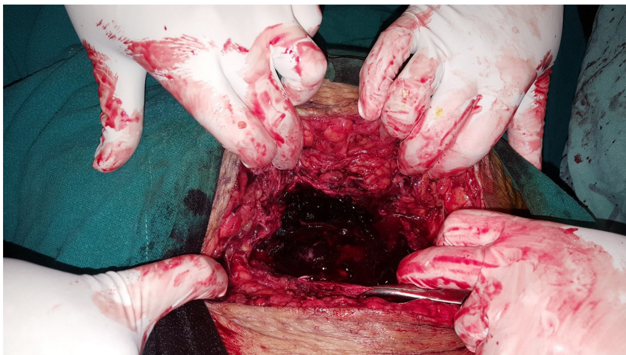
Figure 3. Haematoma in relaparotomy

collection in the pelvis but also fluid extending to the Morrison's pouch was observed. Intraperitoneal blood collection ranged from 400 to 3000 ml