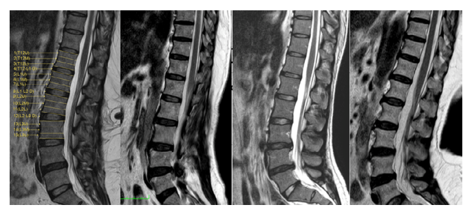
Figure 1: Demonstrates the different shapes of tip of conus categorized as Type A, B and C; and the level of CMt with respect to vertebral bodies and intervertebral discs on T2 weighted sagittal Image

medullaris in the MR spinal images were recorded as type A, type B and type C.<sup>7</sup> Type C is ventrally deviated, type B is central and type A is dorsally deviated conus tip. (Figure 1). Descriptive analysis was done to calculate the level of CM terminations (CMt) and the types.