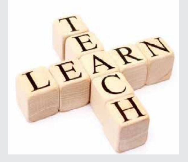
Fig 2: To teach is to learn twice

The art of the teaching is the art of assisting discovery. Professors known as outstanding teachers do two things; they use a simple plan and many examples.