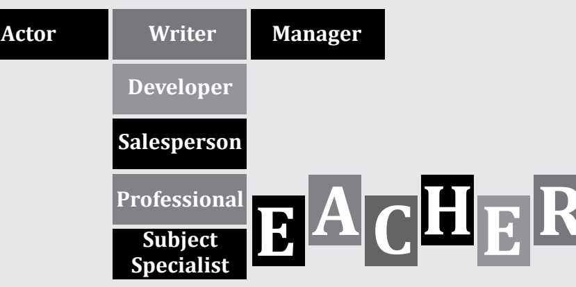
Fig 1: A great teacher

Teaching is an art, to be perfected. Teaching is not a lost art, but the regard for it is a lost tradition.