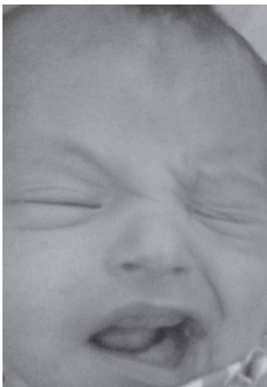
4 th day old baby with right sided LMN type facial nerve palsy having dandy walker malformation.