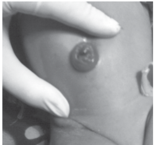
Fig 2: The macroscopic view of the larvae that crawled out of the umbilicus.