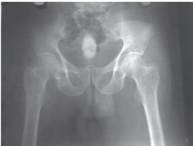
Figure 2: Radiographic view of the calculus.