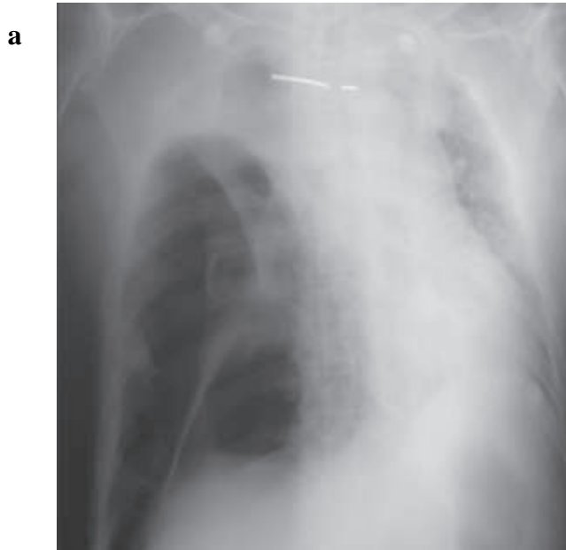
Figure 1: (a) Showing localized pneumothorax in right lung field with mediasternal shift to the

Chest tube was inserted and was removed after 10 day. Patient was discharged with modification of treatment.