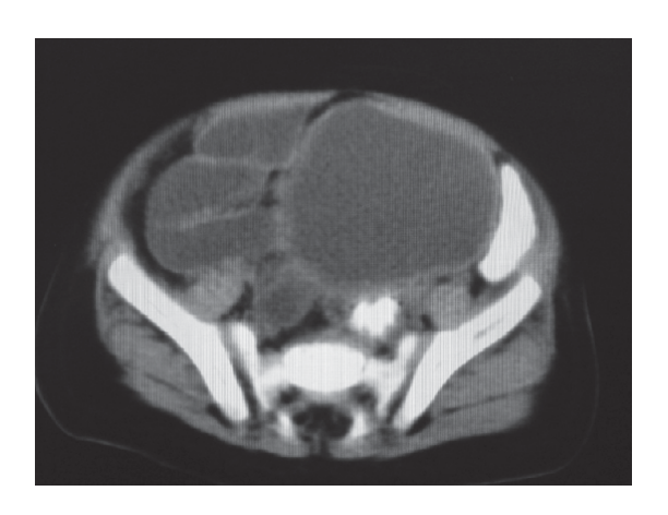
Figure 3 . Axial CT scan at the level of the kidney shows the dilated renal pelvis and right hydronephrosis with cortical parenchymal thinning.