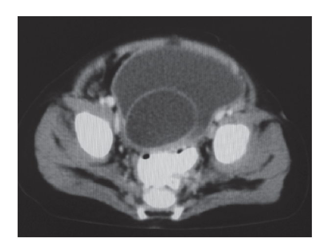
Figure 2 . Axial CT scan (slightly superior to Figure 1) shows the tortuous & dilated lower ureter.