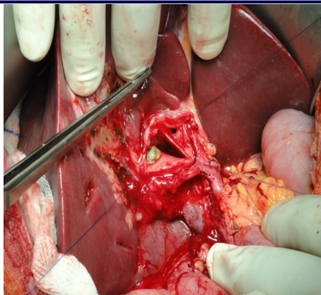
Figure 3: Perforated choledochal cyst in 3yr female child who presented with biliary peritonitis