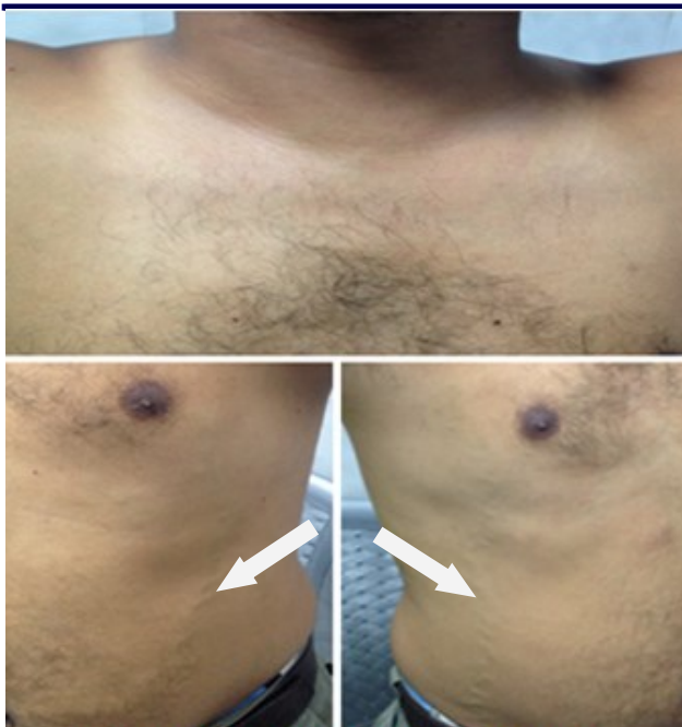
Fig 1: Dilated Superficial Veins

habit of chewing tobacco almost every time after meal for last five years.