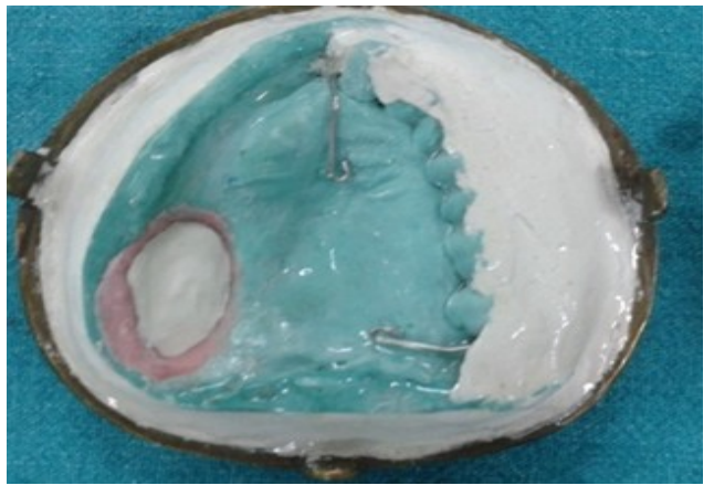
Figure 7: Salt crystals placed over first layer of dough