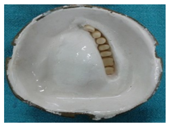
Figure 6: Dewaxing