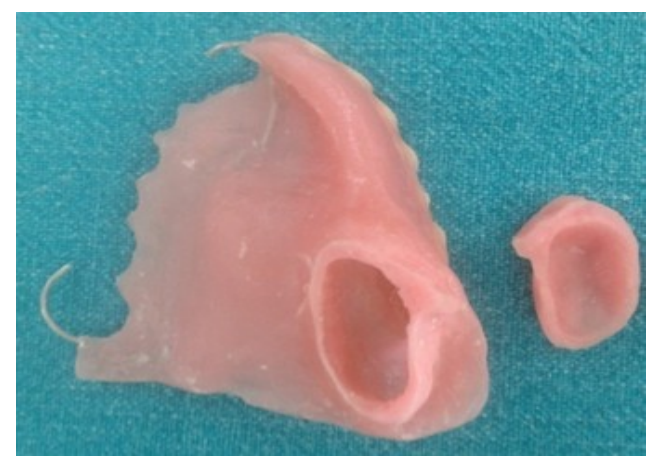
Figure 8: Hollow maxillary denture with lid