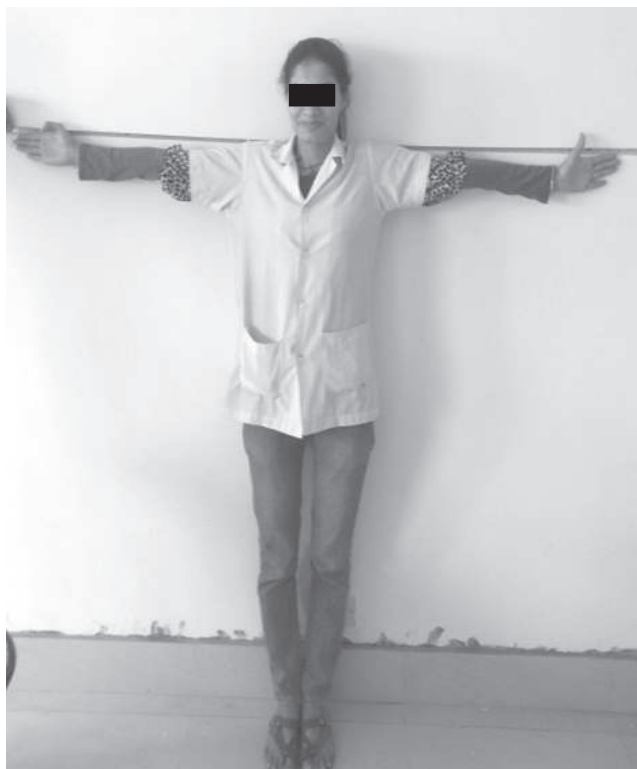
Fig.-1 Procedure of measuring the arm span

average was taken as the best estimate for the true value. When the two initial measures did not satisfy the 0.4 centimeters criterion, two additional determinations were made and the mean of the closest records was used as the best estimate.