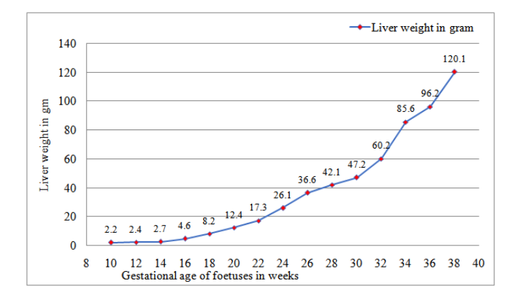
Figure 4: Scatter graph showing weight of liver in gram against gestational age