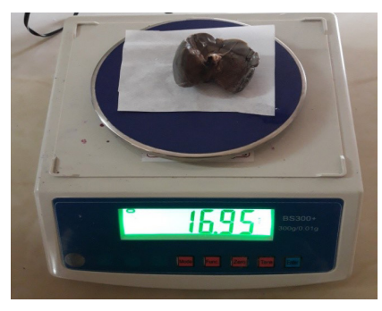
Figure 2: Measuring weight of foetal liver