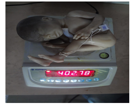
Figure 1: Measuring weight of foetus

Incisions were taken on anterior abdominal from the xyphoid process to the pubic symphysis, from xyphoid process along the costal margin till midaxillary line on either side, from pubic symphysis to Anterior superior Iliac Spine (ASIA) above inguinal canal on either side. Then the flaps were reflected laterally from the midline. The morphological observations were noted on the liver after opening the abdomen. The liver was detached from all the ligaments, porta hepatis and diaphragm. Care was taken not to cut the liver. The weight of the liver was measured in grams on digital weighing machine (Figure 2). The percentage relative weight of liver weight/Body weightX100. All the data were represented as mean then analyzed with Microsoft Excel 2007 software and represented graphically.