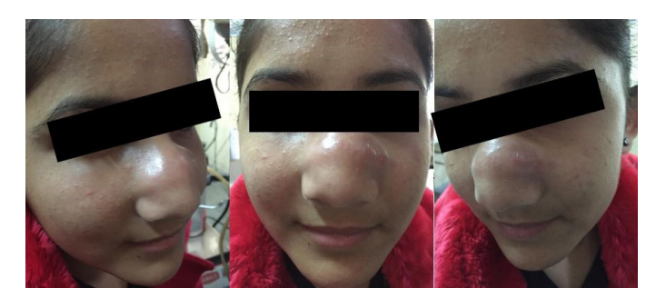
Figure 1: Diffuse erythematous plaque on dorsum of nose

On examination, the nasal cavity looked normal and there was hard, red and tender swelling over the dorsum of nose and adjacent mid-face (Figure 1).