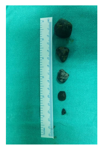
Figure 3: Multiple gallstones with the largest one measuring 2.5 X 2.5 cm

There were three other gallstones accumulated proximal to the largest gallstone measuring approximately 2 cm, 1.5cm and 1 cm respectively. Gross adhesion was seen covering a fistulous tract between gallbladder and first part of the duodenum. The gallstones were extracted by longitudinal enterotomy which was then closed transversely (Figure 3). The patient had an uneventful postoperative course and was discharged on 6<sup>th</sup> post-operative day.