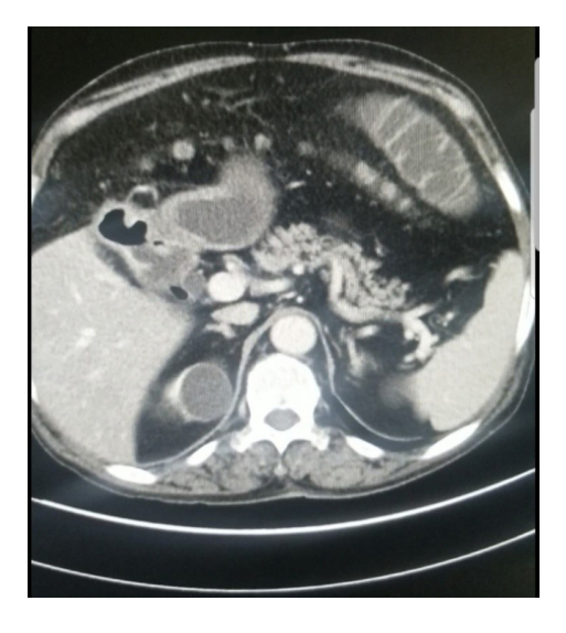
Figure 1: Axial view of abdomen demonstrates air in the gall bladder (pneumobilia)