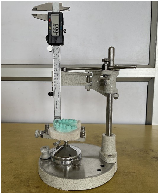
Figure 1: Vertical distance measurement device

(Figure 1 and Figure 2). The flat edge plane of the depth caliper contacted the mesial incisal edges of the maxillary central incisors and the midpoint of the flat edge plane of the depth caliper matched with the midpoint of the maxillary central incisors. Thus, the vertical distance of incisal edge of maxillary central incisor from incisive papilla was measured. The measurements were done by the same investigator at three separate times using the same instrument. The average values of the measurements were calculated using mean, standard deviation and chi square tests. Statistical Package for the Social Sciences version 26 was used for the analysis.