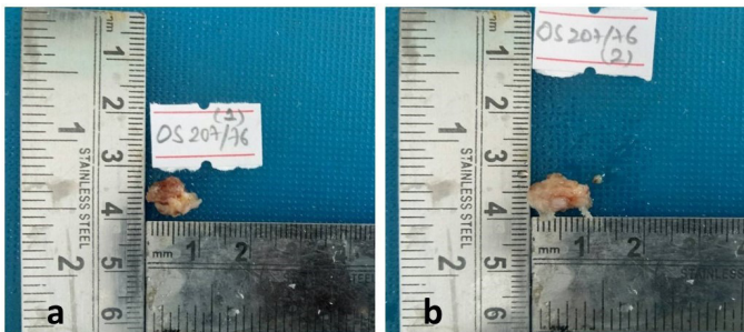
Figure 2: Tissue specimen (a) from buccal mucosa (b) from floor of the mouth

Histopathological examination of both the specimen revealed non-keratinized stratified squamous epithelium showing areas supra basal split. The basal cells showed histologic pattern as "row of tombstone". Cluster of Tzanck cells with hyperchromatic nuclei were seen lying freely in the vesicular space. The basal cells were attached to the basement membrane along with underlying connective tissue. The underlying connective tissue revealed dense chronic inflammatory cell infiltration chiefly lymphocytes and plasma cells (Figure 3). The microscopic features were indicative of Pemphigus vulgaris which was further confirmed by direct immunofluorescence test which revealed IgG in intercellular bridges in epithelium. Based on clinical features, histopathological features and immunofluorescence test final diagnosis of Pemphigus Vulgaris was given.