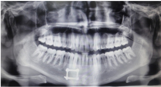
Figure 3: OPG of 90th Post-operative Day

Radiograph was taken preoperatively, on 1 st post-operative day (Figure 2) and on 90 th postoperative day (Figure 3). Radiological Assessment with Post-operative Radiographs (OPG) was done according to Malhotra et al 8 and scores given as shown in Table 1.