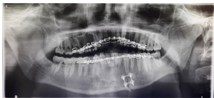
Figure 2: Fixation of Parasymphysis fracture with 3D plate.