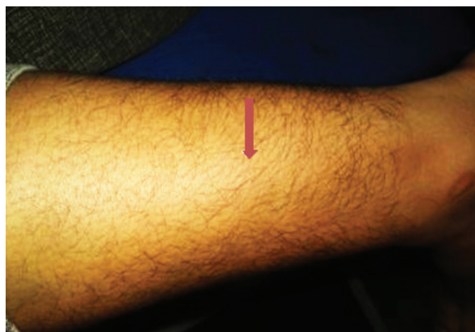
Figure 2. Swelling of the posterolateral aspect of distal third of the left leg.

only on careful inspection but the skin over the swelling was normal. Tenderness was localized on the posterolateral aspect of the left distal leg approximately 8 to 10 cm proximal to the ankle joint. Deep palpation revealed a globular, non-pulsatile swelling of 4x5 cm with indistinct margin and swelling was non adherent to the skin and lying deep in the muscle (Figure 2).