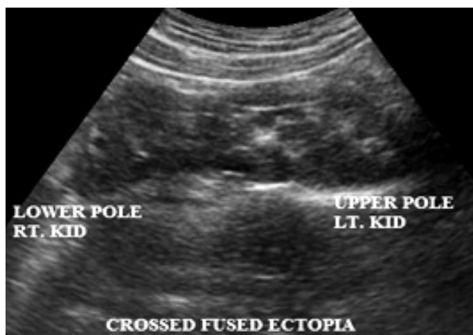
Figure 3: Crossed fused ectopia