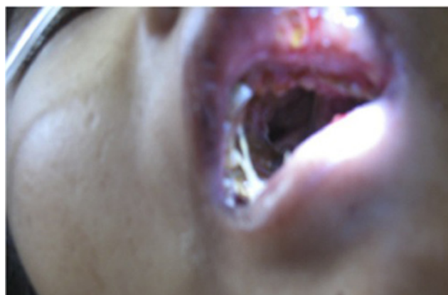
Figure 2. Oral examination reveals extensive infection in hard palate