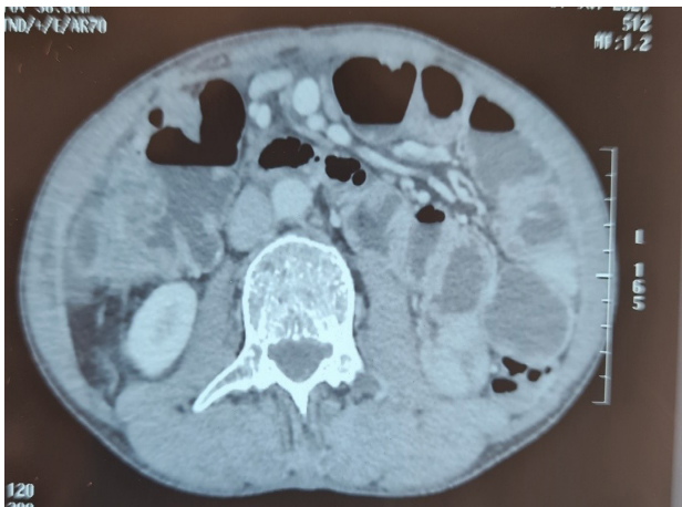
Figure 1 : axial tomography of the abdomen showed right colic thickening

The patient appeared to be in good general health. Clinical exam demonstrated a minor abdominal meteorism and widespread tympany without peritoneal symptoms. The scar of the prior laparotomy was solid. No lump was discovered during the rectal examination. An abdominal CT scan with contrast injection revealed ascending colon distension upstream of a thickening of the right colonic angle (figure 1) and an incontinent ileo-caecal valve with no symptoms of digestive distress.