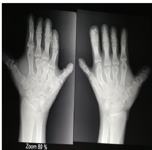
Fig : 1 Polydactyly