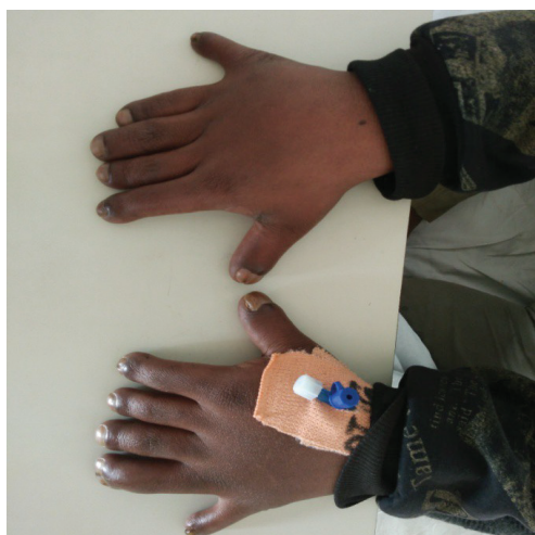
Fig 2 : Polydactyly with nail dystrophy