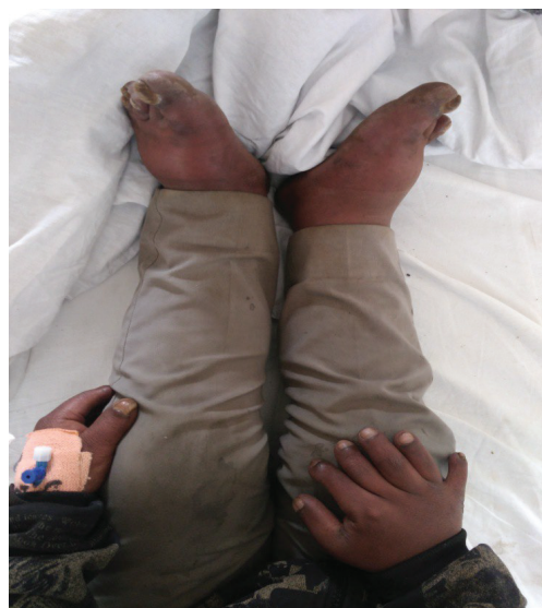
Fig 3 : Limb deformity with genu valgum, talipes equinovarus

venous pulse (JVP) was elevated with prominent 'a' wave. The patient had long and narrow appearing thorax with a precordial bulge. There was cardiomegaly, with apex beat at left 6th intercostal space, 4cm lateral to the mid- clavicular line. Grade III/III left parasternal heave was present. The first heart sound was loud; the second sound was widely split and fixed. The pulmonary component was loud. There was a grade 3/6 pansystolic murmur with inspiratory accentuation audible at left lower sternal border. Chest X-ray revealed cardiomegaly with right atrial enlargement while his ECG revealed normal P wave axis and right axis deviation , p' pulmonale with RVH . His echocardiographic examination revealed situs solitus ,enlarged right ventricle and a common atrial chamber without any interatrial septum (Fig. 5) . The right and left components of the common AV valves were at the same place with evidence of regurgitation through both the components of the valve. There was evidence of pulmonary arterial hypertension (PAH) in the form of right ventriculo- atrial gradient of 89 mm Hg . A diagnosis of common atrium anomaly with severe PAH was made.