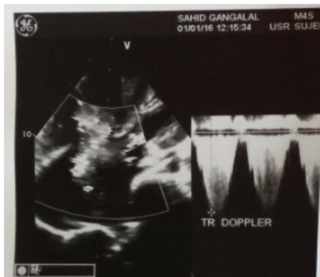
Fig 5 : Common atrium defect with TR jet and PAH