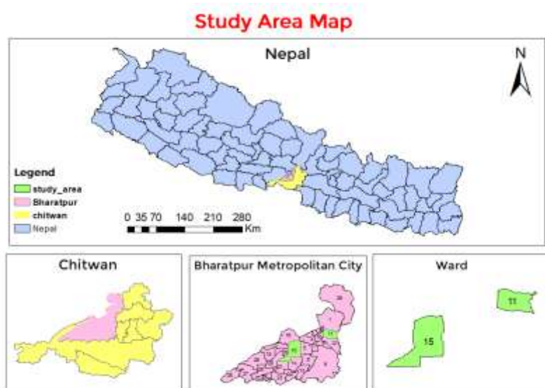
Fig. 2: Map of Research Site.

A Probit model was used to determine the factors that influence farmers to cultivate carrot in the large area in Chitwan district. For categorizing the size of the farm, an average farm size of 80 farmers was calculated. Farmers with the landless than the average were considered as smallholder carrot producer and more than that were considered as commercial carrot producers. Farmers of ward no. 15 were commercial carrot producers. The probit model had two categories independent variable and it is the probability model (Liao, 1994). In the binary probit model, Farmers cultivating carrot more than 15 kattha is taken as 1, while those cultivating less than 15 kattha is taken as zero. It is assumed that the i^{\text{th}} farmers obtain maximum utility, it has commercial cultivation preference over small farm holders.