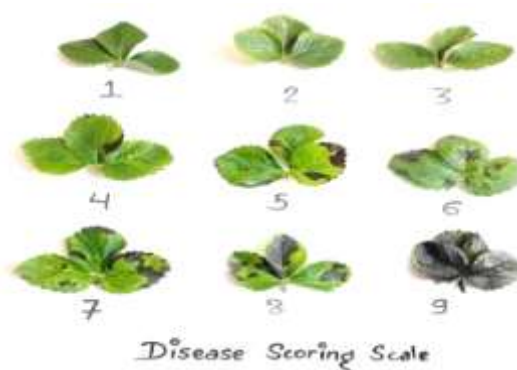
Fig. 1: Pictorial disease scoring scale