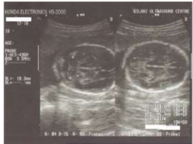
Fig. 2: 27 weeks of gestational age and transverse cerebellar diameter Measurement 27.0mm.

Fig. 2 shows that biparietal diameter and transverses cerebellar diameter shown in this ultrasound image 27 weeks of gestational age and transverses cerebellar diameter Measurement 27.0mm