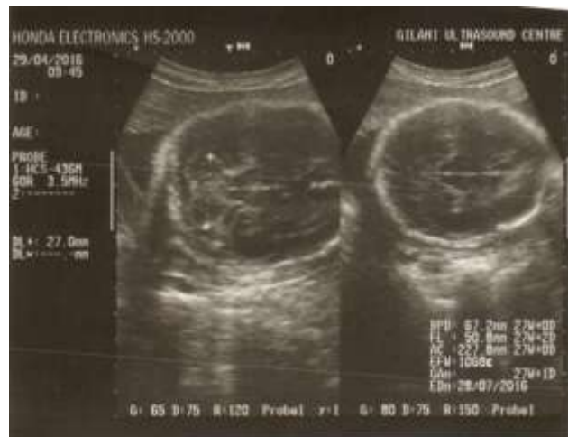
Fig. 3: 30 weeks of gestational age and Transverses cerebellar diameter Measurement 31.9mm

Biparietal diameter and Transverse cerebellar diameter shown in this ultrasound image (Fig. 2) 30 weeks of gestational age and Transverse cerebellar diameter, Measurement 31.9mm.