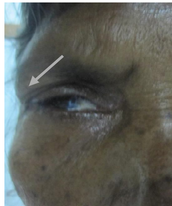
Figure 1: A 20 x 10 mm swelling in the temporal quadrant of the right supraorbital region (arrow) and a phthisical right eye.

The overall histomorphological features were those of malignant melanoma.