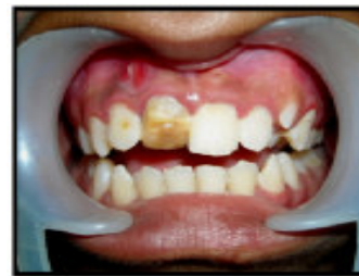
Fig.1 Dilaceration of maxillary right central incisor with palatal inclination

A clinical examination revealed severe crown dilaceration of maxillary right central incisor with palatal inclination (Fig.1). The incisal and middle third of the crown had yellowish brown discoloration suggestive of enamel hypoplasia. Gingival swelling was present in relation to same tooth with pus discharging sinus.