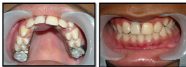
Fig. 3 & 4: After prosthetic rehabilitation

Treatment involved removal of tooth with prosthetic rehabilitation (Fig 3 & 4).