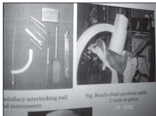
Fig.1 Image intensifier

Patients was placed in the beach chair, semisitting position, with affected arm draped free. The image intensifier is brought in directly laterally on the injured side and the patient is brought on the edge of the table [Fig.1]. It is important to check and ensure a good X-ray of the entire humerus is possible. The surgeon stands at the top of the bed looking down on the shoulder and the assistant stands below on the other side of the image holding arm. A small incision was made at the anterolateral corner of the acromion, the