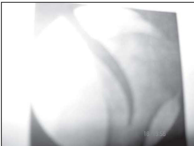
Fig.2 Anterolateral approach

deltoïd was split and any visible subdeltoïd bursa was excised [Fig.2]. The supraspinatus tendon was identified, and split for 1-2 cm in line with its fibres. The entry point was in greater tuberosity, just lateral to the articular margin. The canal was broached with either an awl or a starter reamer placed over guide wire. A long guide wire was then passed to the fracture site, only nail greater than 6 mm in diameter was cannulated. Reamming was done till chattering sound of cortex was heard, and then inserted nail 1 mm smaller in diameter than last reamer used. The length of nail was carefully chosen and checked twice, put in the medullary cavity. The nail was then locked with screws using zig proximally and free hand technique distally [Fig. 3a,b,c,d]. Any split in rotator cuff was repaired, incision was closed in layers. standard dressing was applied, no external splint was applied.