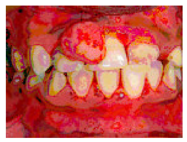
Fig 1: Pre-operative lesion.

The lesion was firm in consistency and non-tender with minimum bleeding. In addition, the patient had poor oral hygiene. Due to the relatively small size of the lesion an excisional biopsy along with the histopathologic evaluation was done as the treatment (Fig 2).