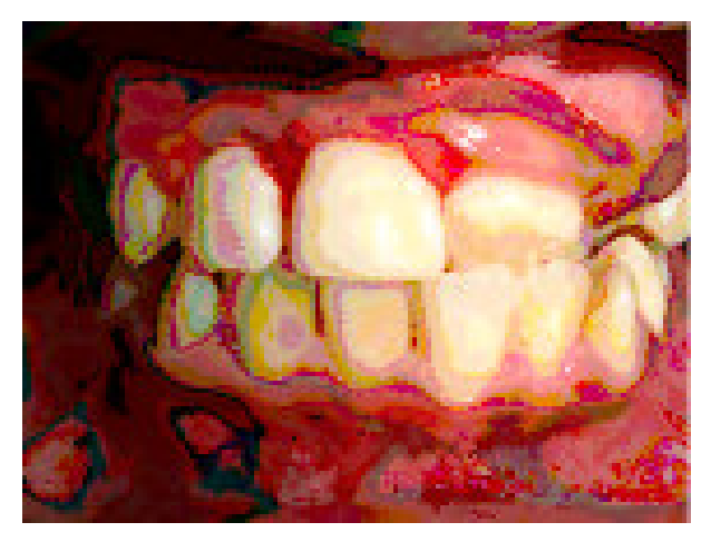
Fig 2: Excision of lesion done.

The lesion was firm in consistency and non-tender with minimum bleeding. In addition, the patient had poor oral hygiene. Due to the relatively small size of the lesion an excisional biopsy along with the histopathologic evaluation was done as the treatment (Fig 2).