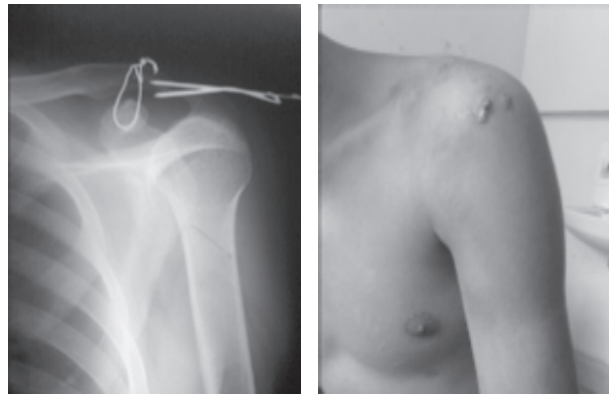
Figure:3 SS/K-wire wires fixation