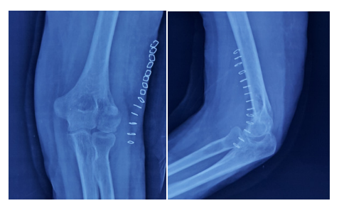
Fig.4: Postoperative radiograph

The post operative outcome was uneventful. Active and active assisted elbow and forearm range of motion exercise was started from second postoperative day. She is able to flex and extend her elbow and supinate and pronate her forearm nearly through full range.