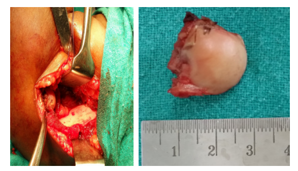
Fig. 3a: Peroperative photograph showing capitellum fracture; Fig.3b: Excised capitellum

Patient was treated by excision of the capitellum through lateral approach and mobilization of elbow under anesthesia (Figure 3). Postoperatively, her elbow was placed in an arm sling at a right angle, with the forearm in a neutral position.