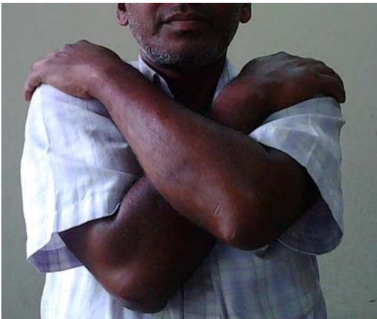
Figure 2a and 2b: Three months post-operative clinical photographs showing satisfactory range of motion.

The joints dislocated with minor degree of movements even with well applied shoulder derotation immobilizer. So, these reductions were unstable and needed fixation of both sides greater tuberosity with cannulated cancellous (CC) Screw. Both shoulder joints were immobilized for 3 weeks and subsequent rehabilitation yielded a good outcome. At 3 months follow-up, he was very happy with stable and satisfactory range of motion of both shoulders (Figure 2a and 2b).