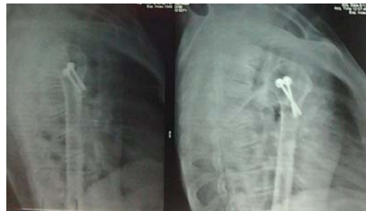
Figure 3a and 3b: Three months postoperative anteroposterior and transthoracic lateral radiographs showing union of bilateral greater tuberosities fracture