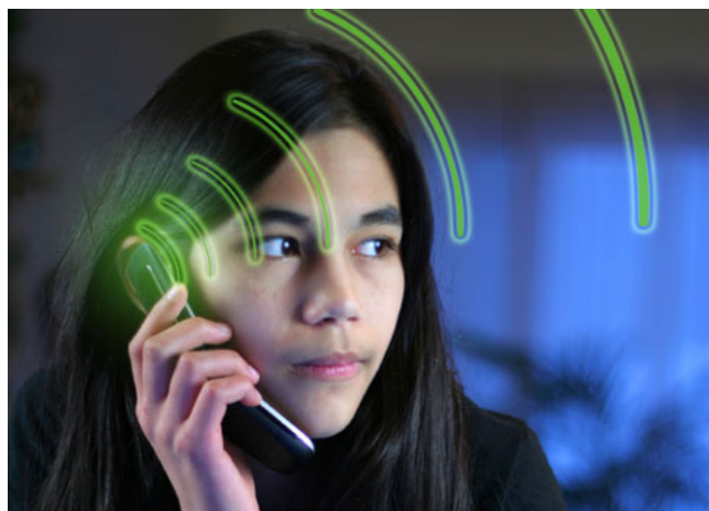
Fig 3: Emission of radiation from cell phone while in use

microwave radiation from the cell phone heats the blood in the ear lobe and its temperature increased by nearly 1.80°F, causing the normal body temperature of 98.40°F to rise to 100.20°F. This leads to ear pain, haring loss and ear tumor. On the other hand when we continuously use cell phone for about 20 minutes, temperature of ear lobes increases by 1°C.