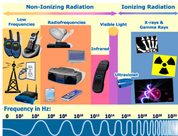
Fig 2: diverse uses of electromagnetic radiation

Besides mobile communication, the radio frequency in the microwave and radio spectrum is used in a number of practical devices for professional and home use. The cordless phones operating at a wide range of frequencies, remote control devices for opening gates, portable two-way radio communication devices, such as walkie-talkies, wireless security (alarm) systems, wireless security video-camera, radio links between buildings for data communication, baby monitors, smart meters and so on. These devices are in frequent touch with the concerning people as well as nearby public. There are other kinds of ionizing radiation such as X-ray or gamma rays, relatively more harmful to our body. Unlike ionizing radiation radio frequency fields cannot cause ionization or radioactivity in the body.