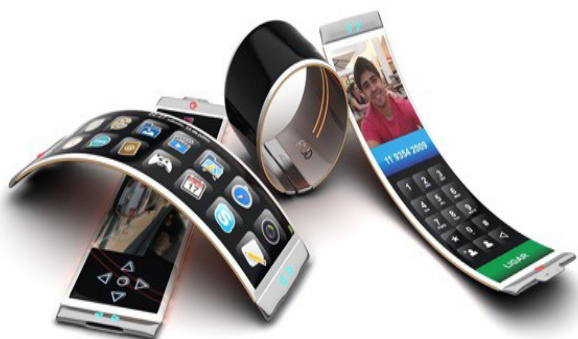
Fig. 1. Future generation cell phones

The nomenclature of the cellular wireless generations (G) generally refers to a change in the fundamental nature of the service, non-backwards compatible transmission technology and new frequency bands. New generations have appeared about every ten years since the first move from 1981 analog (1G) to digital (2G) transmission in 1992. This was followed in 2001, by 3G multi-media support, and in 2011 by 4G, which refers to all-IP switched networks, mobile ultra-broadband.