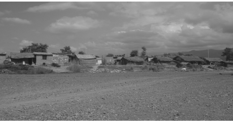
Photo 4. River Encroachment by Sukumbasis (Landless People)