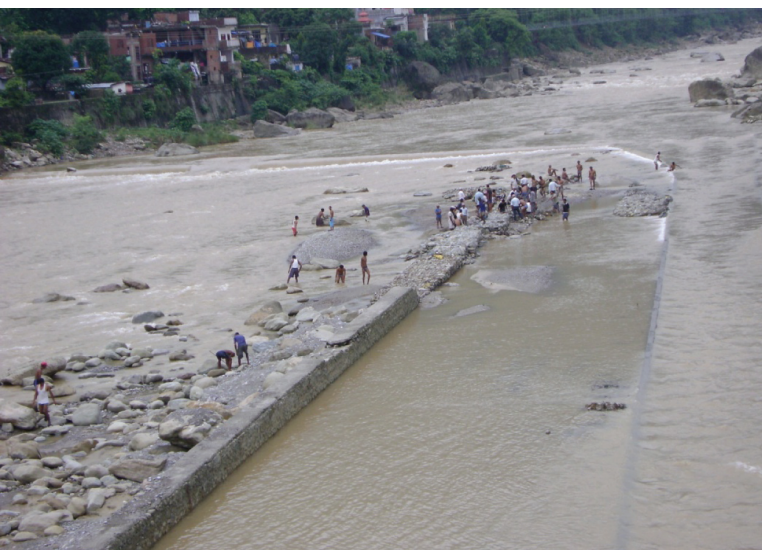
Photo 2. River Diversions near Butwal for Sorah-Chhattish System

This project is located in the Rupandehi District