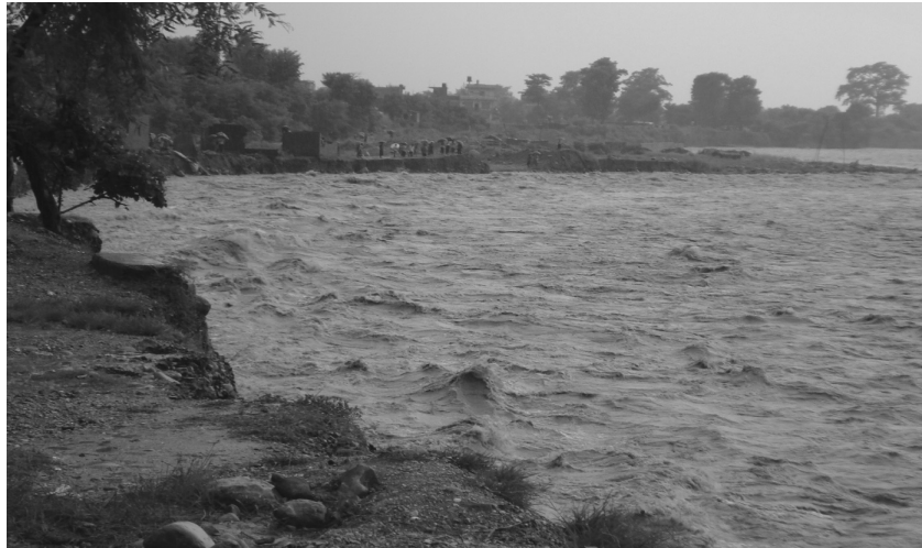
Photo 1. View of the River Flooding

Rupandehi District in Terai is one of the richest districts in groundwater potential. Unconsolidated sediments forming highly permeable aquifers, some of