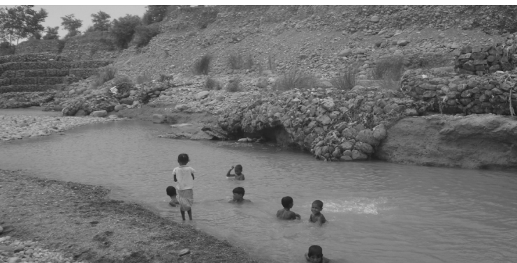
Photo 3. Bank Breaching Due to Deepening of River

only. There was news in the media that recent monsoon flooding washed away part of the Peoples' Embankment.