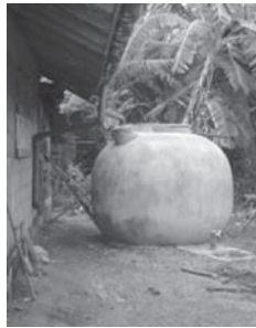
Ferro cement above ground tank