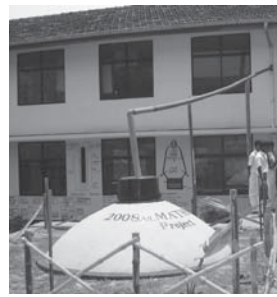
Partial under ground Ferro cement tank