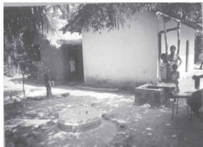
Brick under ground tank