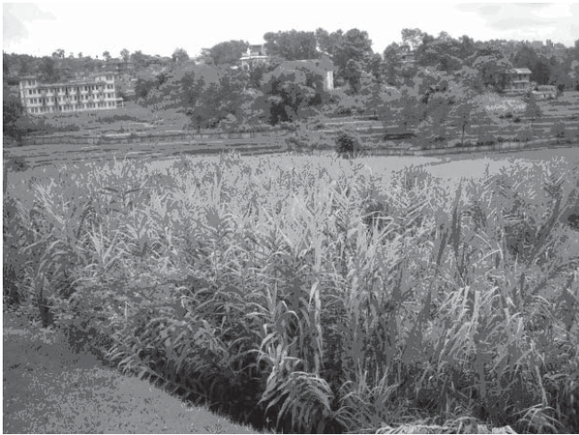
Figure 3. CW at Kathmandu University