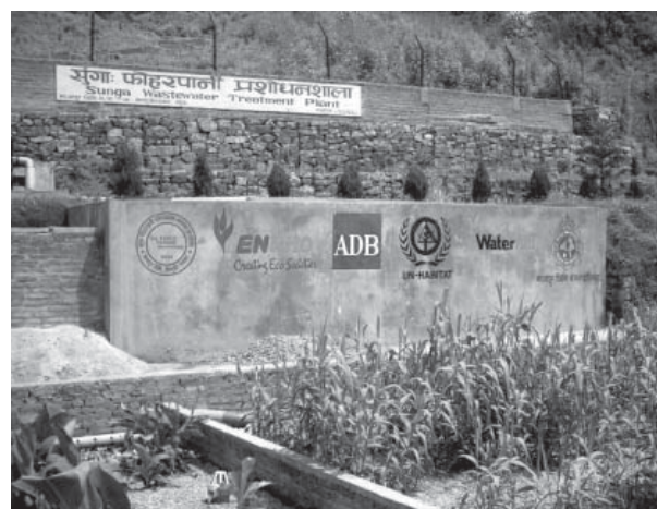
CW at Sunga Wastewater Treatment Plant

Begin its operation since October 2005, Sunga Wastewater Treatment plant was designed by ENPHO, established with financial support from Asian Development Bank (ADB), UN-HABITAT and Water Aid Nepal (WAN). This is the only community based Reed Bed System or Constructed Wetland in Nepal designed to treat the wastewater of about 1200 population from 200 households of Madhyapur Thimi Municipality in Nepal but it is currently treating wastewater from 80 households only. The plant bed consists of a three-chambered anaerobic baffle reactor with a capacity of treating 42 m 3 of load as primary treatment unit. Second treatment unit consists two horizontal flow reed beds followed by two vertical flow reed beds with total area of 150 m 2 respectively and provided with a sludge drying bed with an area of 55m 2 . The total capacity of the plant is 50 m 3 of wastewater per day. The municipality provided land for plant and has been providing financial assistance for its operation and maintenance. The support from local community reflects that construction of such treatment plants at other locations is the need of day and only then the problem of waste water management can be efficiently reduced.