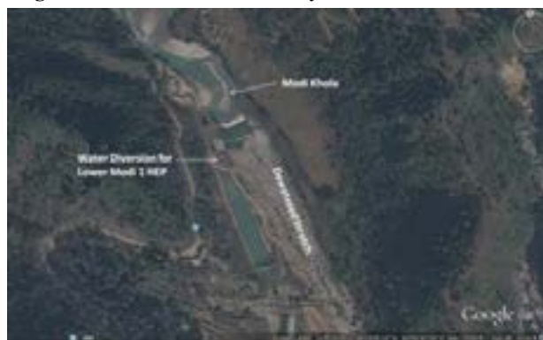
Figure 2: Google Image of Headworks of Lower Modi 1 HEP

In case of the Modi Khola, fish ladder has been constructed as a mitigation measure for migration of fish in Lower Modi Khola 1 HEP. The field visit revealed that the fish ladder is not functional as no water was flowing downstream of the dam. Figure 2 also depicts the dewatered stretch of the HEP indicating the fragmentation and discontinuity of the fish habitat.