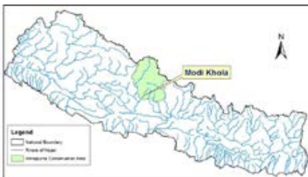
Figure 1: Location of the Modi Khola

The Modi Khola (Nepali name for a small river or stream) is one of the major tributaries of Kali Gandaki River in western Nepal. The total length of the main-stream of the Modi Khola is about 50 km. The Khola originates from the melting of snow and glaciers of the Annapurna Range, in Kaski district and finally joins the Kali Gandaki River at Modi-Beni of Parbat district. The upper reaches of the Khola lies within the Annapurna Conservation Area.