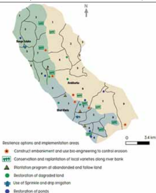
Figure 3: Located EbA options in Andheri Khola sub-watershed (excerpt from Dixit, Karki and Shukla 2015)

Participants for Andheri sub-watershed identified land, forest and water as the three key ecosystems that are vulnerable to climate change. It was argued that