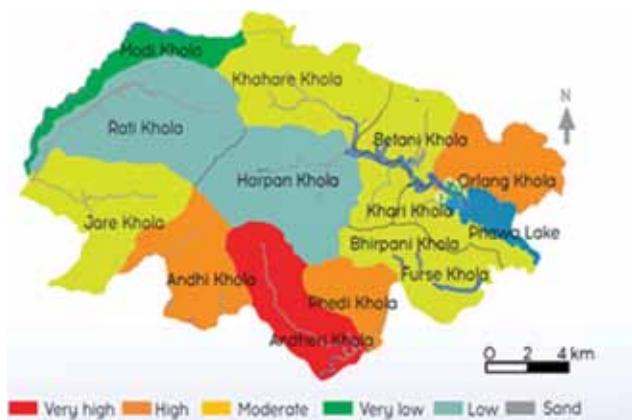
Figure 1: Vulnerability categories at sub-watershed level (Excerpt from Dixit, Karki and Shukla 2015)

Assessing vulnerability is the first step to devising EbA measures. Many definitions and attempts to quantify vulnerability exist, however no agreement on the set of indicators to do so has reached yet. IPCC's Fourth Assessment Report in 2007 used the term of vulnerability as 'a function of the character, magnitude, and rate of climate change and variation to which a system is exposed, its sensitivity, and its adaptive capacity'. Starting from this, the EbA-Nepal project established a set of indicators for vulnerability to climate change through the work carried out by ISET-N. A total of 32 indicators – 8 on exposure, 8 on sensitivity, and 16 on adaptive capacity – were selected through reviewing global literature and in consultation with local stakeholders. All indicators were weighed equally to have numerical value between -1 to 1. To improve visualization, values were sectionalized into five groups – very low, low, moderate, high and very high, respectively (Dixit, A. et al 2015).