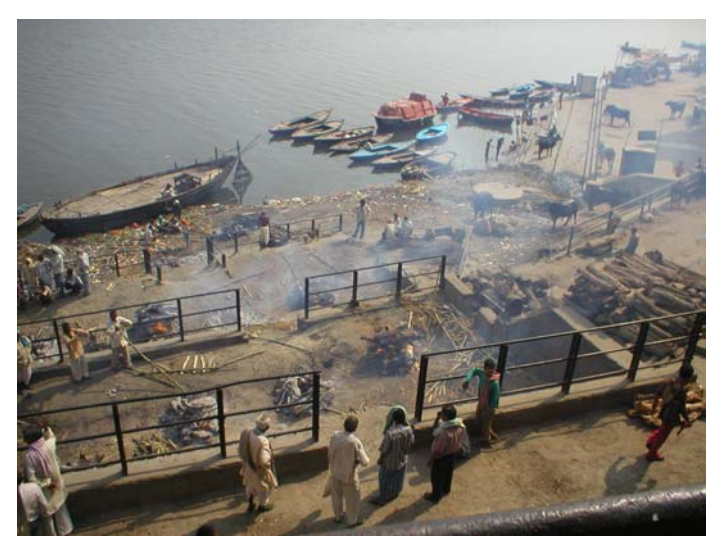
Fig. 3. Manikarnika Ghat, Varanasi