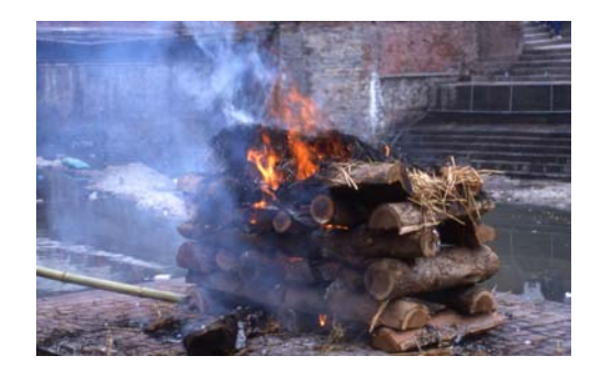
Fig. 1. Cremation at Pashupatinath

The preparation of the flesh of the body is the essence in the funeral rite because of the dual function of death; the individual's destiny and the future of society. It involves soteriology at two levels. Without ethicisation of death and the flesh for further life, the process of ethicisation step 1 would not have turned into ethicisation step 2. A karma ideology necessitates more than just individual punishments and rewards since humans are miniature replicas of the gods. Therefore, the divine will and cosmic battles in Kali yuga have to be incorporated into this system, and the transformation of flesh into life-giving waters or energies is the most important part in death rituals. Providing society with the life-giving water is the primordial task for the gods. It is the best soteriology possible on earth; the perfect and eternal salvation is in heaven.